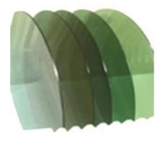
Silicon carbide products -Nankan Factory (2023.1)

6" Silicon Carbide (SIC) Wafer 5 crystal growth furnaces will be increased to 10 in 2023Q3.